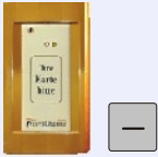
Transponder On Wall