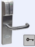
Magnetic On Door